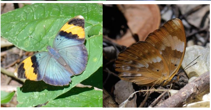
Euphaedra neophron \supseteq upper \& underside