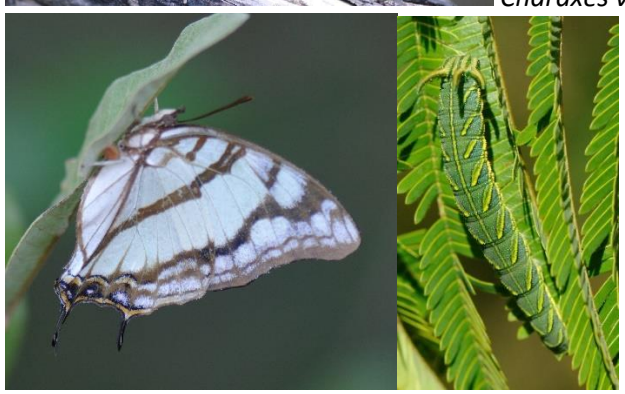
Charaxes zoolina zoolina abla & larva