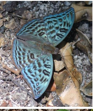
Euryphura achlys 👌