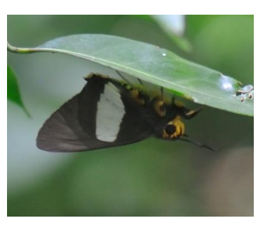
Coeliades forestan foestan