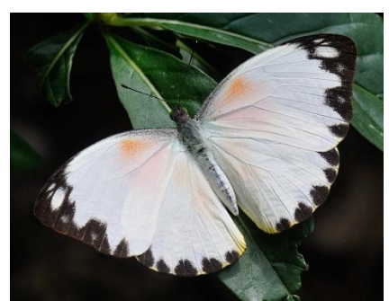
Nepheronia argia mhondana \mathcal{P}