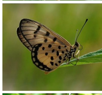
Acraea dondoensis \circlearrowleft