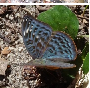
Euryphura achlys ♀