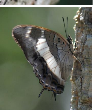
Charaxes baumanni whytei \stackrel{\bigcirc}{\scriptsize}