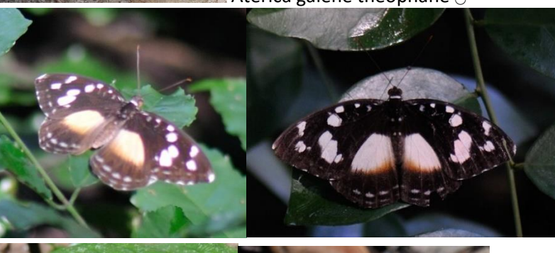
Aterica galene theophane \, \, \, \, \, \, \, \,