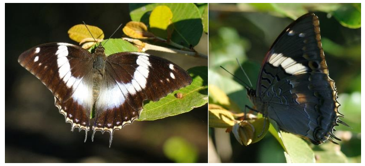
Charaxes Cithaeron Cithaeron \stackrel{\bigcirc}{\leftarrow}