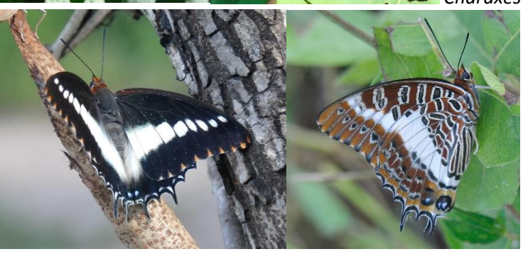
Charaxes brutus natalensis \mathop{\supsetneq}