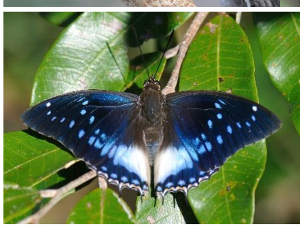
Charaxes cithaeron cithaeron ♂