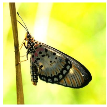
Acraea aglaonice ♀