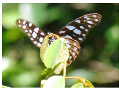
Graphium leonidas ♀