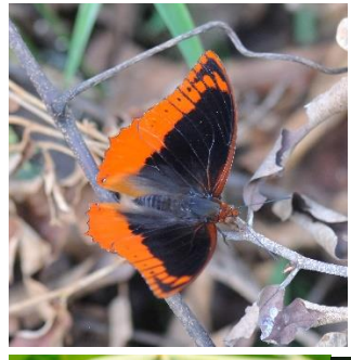
Charaxes protoclea azota 👌