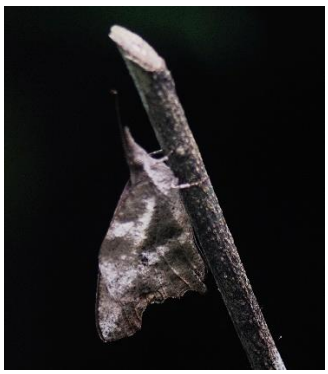
Libythea labdaca laius