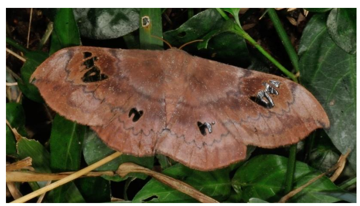
A specimen from the genus Adafroptilum a member of the emperor moth group. Investigations may show this to be an undescribed species.

A specimen collected on one of the Author's expeditions (May, 1969) in the Dondo forest area of Mozambique, may represent a distinct species rather than a race or subspecies. It is much more distinctly marked on the upperside and the underside has very prominent lines, unlike the normal incana .