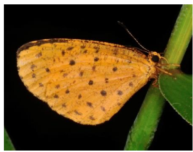
Pentila tropicalis fuscipunctata