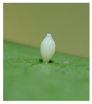
egg of Nephronia thalassina sinulata