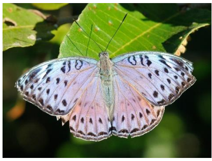
Euryphura Concordia ♀