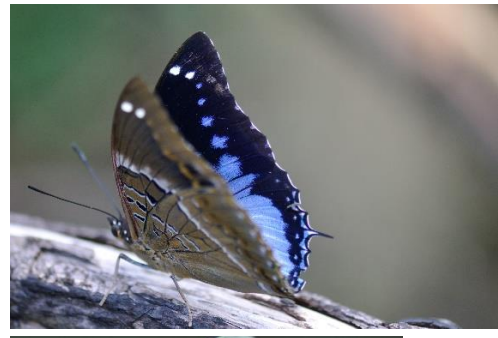
Charaxes violetta melloni ♂