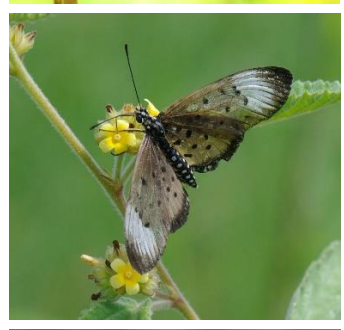
Acraea oncaea \stackrel{\bigcirc}{\scriptstyle \sim}