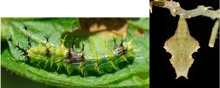
Eurytela dryope angulata larva & pupa