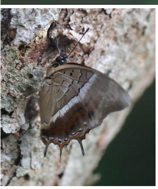
Charaxes baumanni whytei 👌