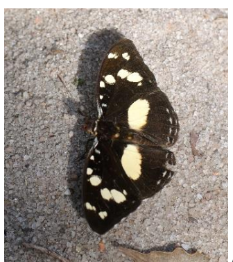
🖁 Aterica galene theophane ♂