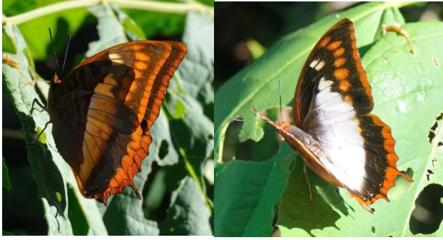
Charaxes protoclea azota \stackrel{\frown}{\scriptscriptstyle extstyle }