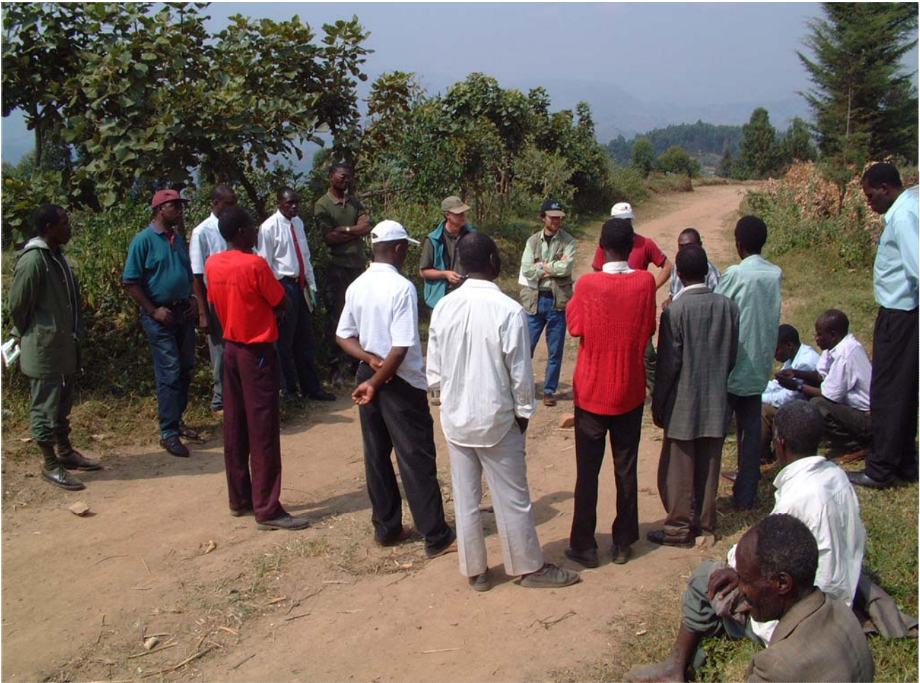
Understanding community perspectives is an important issue for both researchers and managers