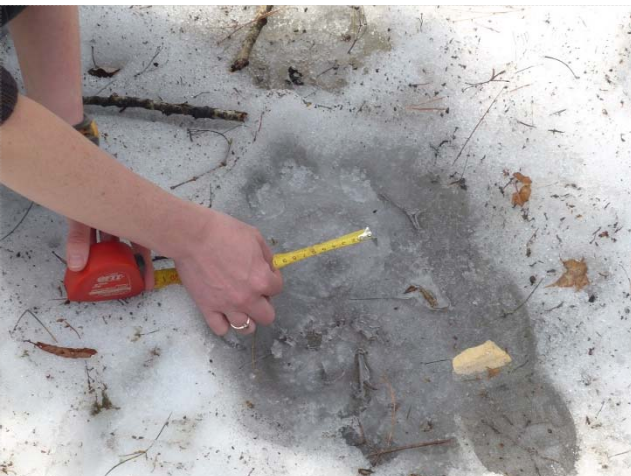
Tiger researcher in Sikhote-Alin Nature Reserve, Russia

on paleo-histories of human impact on (the measurable elements of) biodiversity.