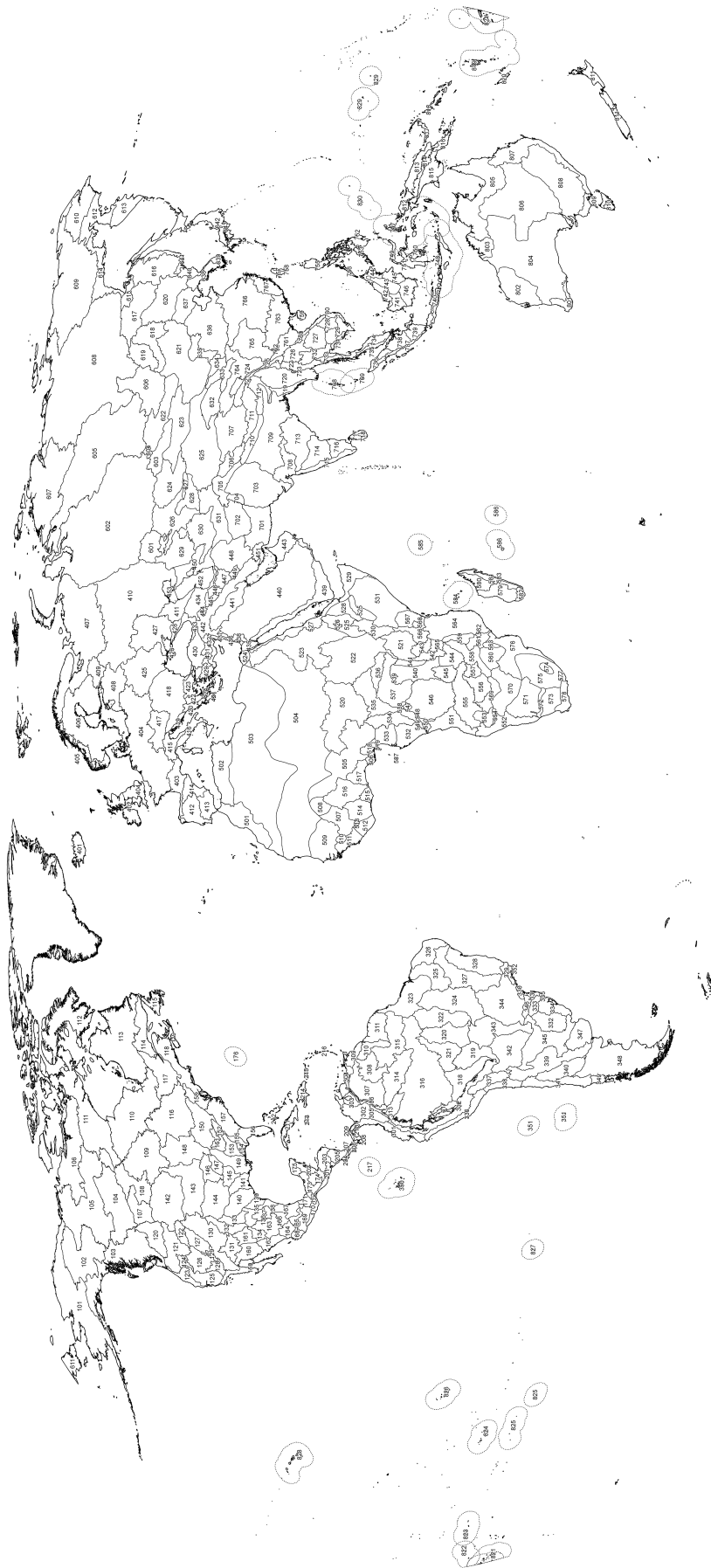
Figure 1. Map of freshwater ecoregions of the world, in which 426 ecoregions are delineated. An interactive version of this map that includes additional information is available at www.feow.org .