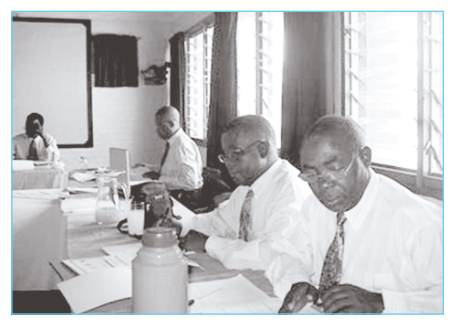
IWRM training for strategy formulation

This is to be supported by the development of a shared water information system for the basin, a rapid assessment report high-