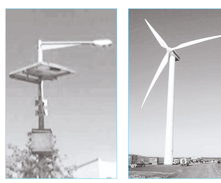
Alternative energy sources such as sun and wind can provide light for evening activities.

The stoves save households from daily exposure to noxious firewood smoke, which claims nearly a million children's lives in the