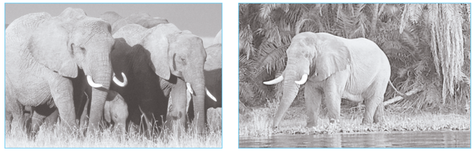
Elephants are part of the spectacular large mammal species that grace the Zambezi basin

Botswana has an elephant population of 106,000 which is more than double the country's carrying capacity of 50,000.