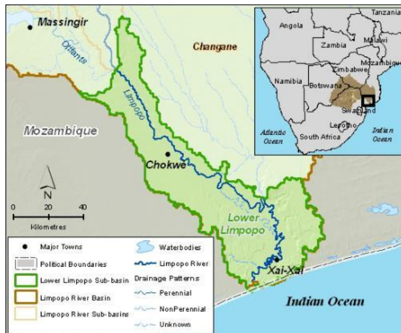
Fig. 1 - Geographical location of the Xai Xai District.