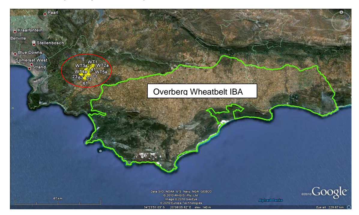
Figure 1: Location of the study area relative to the Overberg Wheatbelt IBA.

The study site is located in the Overberg wheatbelt. The mosaic of wheat, barley and canola fields interspersed with pastures that comprises the area known as the Overberg Wheatbelt, is classified as an Important Bird Area (IBA) (Barnes 1998) – the study area falls marginally outside the formal IBA borders, but in similar habitat. This large agricultural district stretches from Caledon to Riversdale and encompasses the area south of these two towns, running between the coastal towns of Hermanus and Stilbaai (see Figure 1). The topography consists of low-lying coastal plains and consists primarily of cereal croplands.