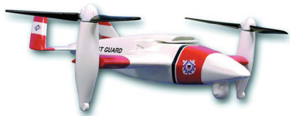
HV-911 Eagle Eye Tiltrotor