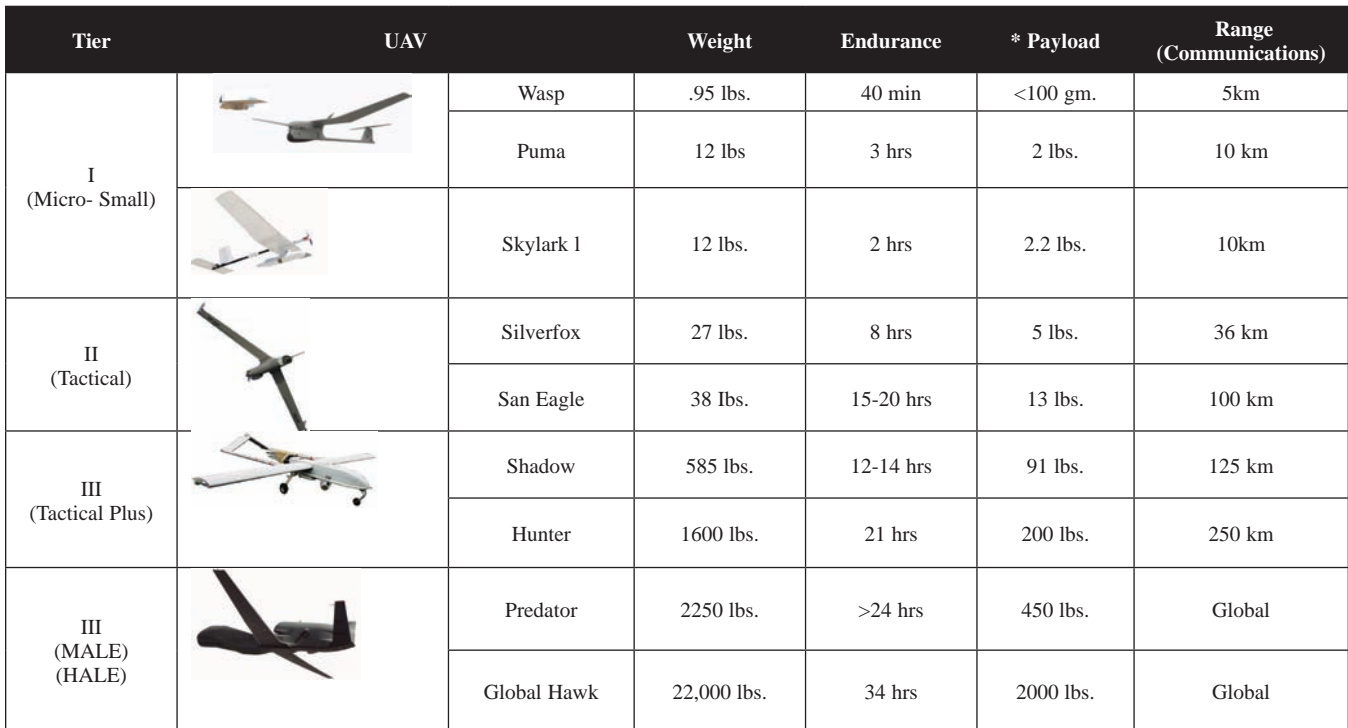
TABLE 1: UAV TIER STRUCTURE