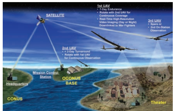
Diagram 1. Operational Concept of the HALE UAS

Global Observer is the latest development in High Altitude Long Endurance (HALE) UAS, which will be able to provide long-dwell stratospheric capability with global range and no latitude restrictions.