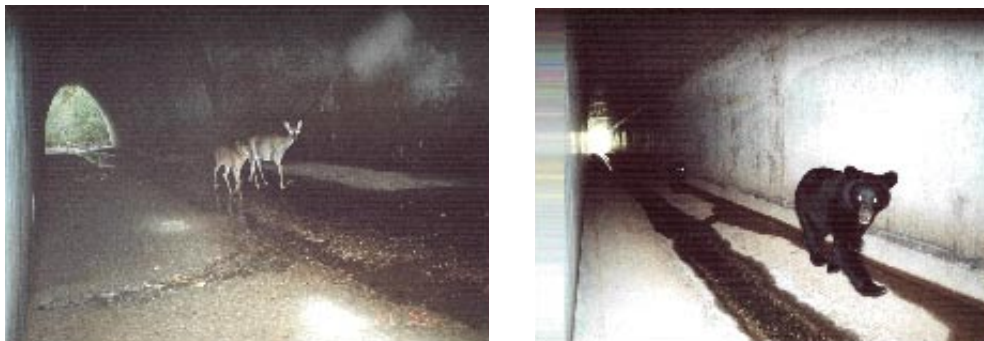
Fig. 4. Two examples of culverts monitored during the Phase I study with wildlife traveling through them.