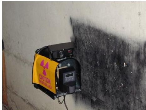
Fig. 3. TM550 Trail Master Infrared monitor bolted to the culvert wall.

these movements and take a picture called an “event.” A Trail Master TM35-1 camera kit was purchased separately, which consists of a Yashica T4 Super D camera, 25-foot camera cable, camera shield, and a tree pod for mounting. This camera requires 35mm film and has been specifically adapted for use with TrailMaster systems. The camera is triggered from the monitor to take a photograph when the infrared transmitter beam is broken. The monitor picks up any warm-blooded mammal movement through the area of sensitivity. This transmitter sends out an infrared beam which is 65 feet long and spreads an elliptical cone of 150° wide and 4° high. The 4°-vertical-beam height spreads one foot for every ten feet away from the monitor. Thus, at 40 feet, there is a four-foot-high beam. This monitor has a sensitivity setting, which allows the user to select the size and movement of the animals to be monitored. This sensitivity setting works by registering the amount of interrupted pulses within a selected time period. A larger animal (bear or deer) will interrupt more pulses in a given time frame than a smaller animal, such as a raccoon. There is also a camera delay setting allowing a delay between photographs from 0.1 to 98 minutes, so that a single event will not be counted multiple times.