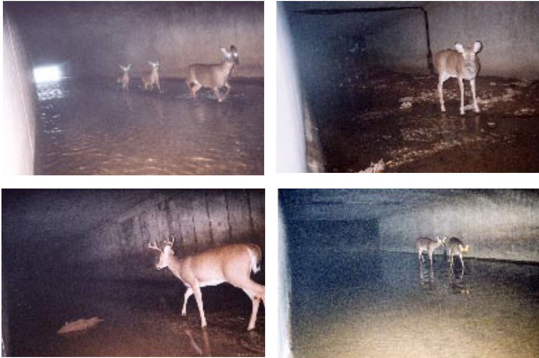
Fig 5. Four examples of culverts with white-tailed deer traveling through them.