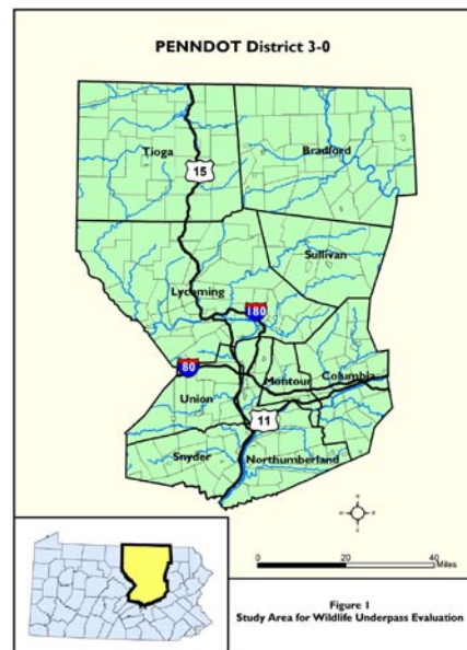
Fig.1. Study Area of the Wildlife Underpass Evaluation.

A.D. Marble & Company (ADM) in conjunction with PENNDOT District 3-0 conducted this research to investigate animal passage through existing drainage box culverts, arch culverts and bridges on existing highway systems. The objectives of this study are to determine whether wildlife are using existing structures as passageways based from field screening surveys and remote camera monitoring, and determine underpass dimensions, interior characteristics, location, topography, and adjacent habitat features that contribute to and enhance usage of underpass corridors for wildlife in North Central Pennsylvania (see fig. 1). ADM evaluated existing structures being used and/or their potential use by wildlife based on field evaluation of structures, adjacent habitat cover, nearby land uses, identification of wildlife sign, and an infrared remote camera monitoring study.